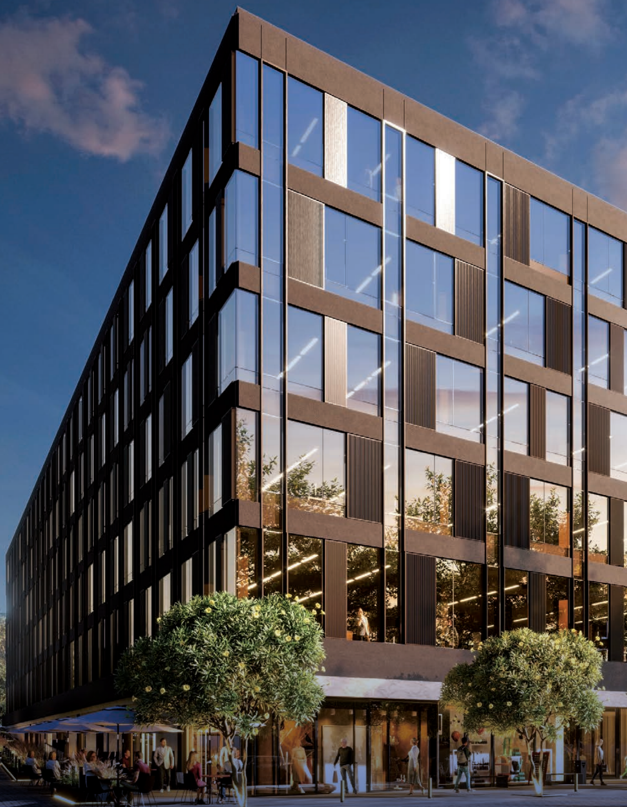
MC55 Office Białystok, PL