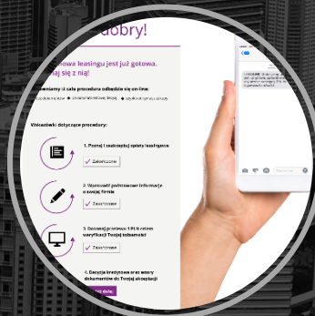
PIN AND LOGIN