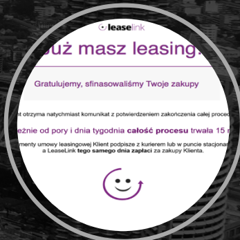
HERE IS YOUR LEASING